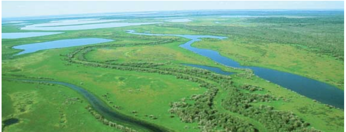
Athabasca Delta greenery near Wood Buffalo National Park. This critical migratory bird habitat, downstream from the tar sands mines, is at risk due to the large amount of water diversions and toxic waste released in close proximity to the Athabasca River by tar sands producers.