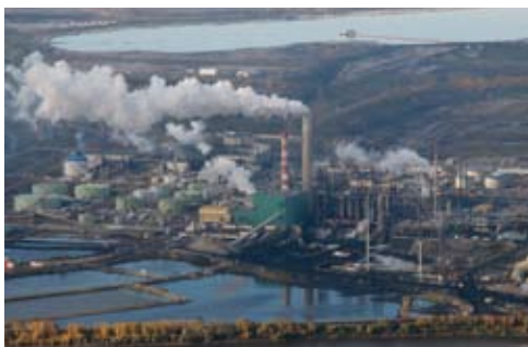
Suncor tar sands upgrader along the Athabasca River.