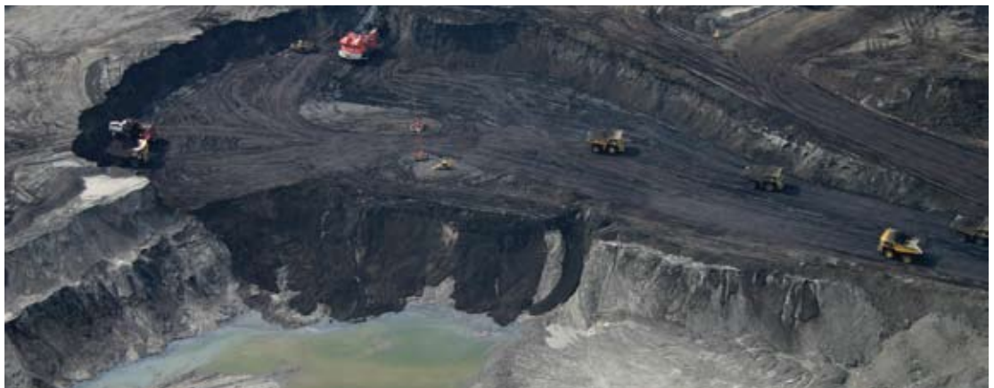
Syncrude tar sands open pit mine.