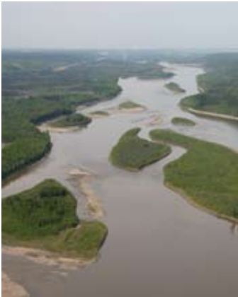
Athabasca River near Fort McMurray, Alberta.