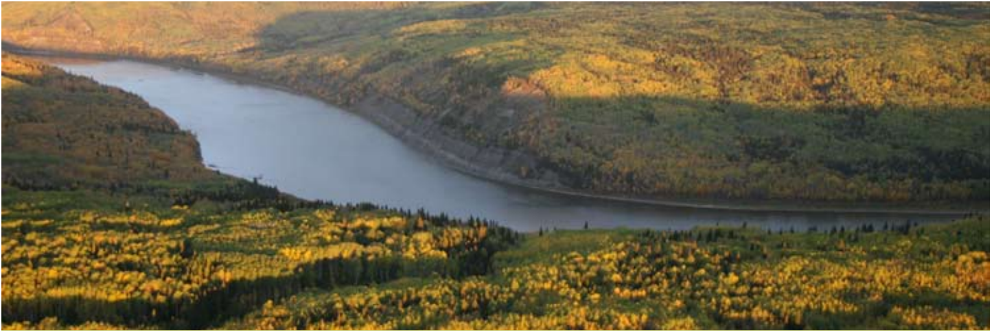
Athabasca River south of Fort McMurray, Alberta.